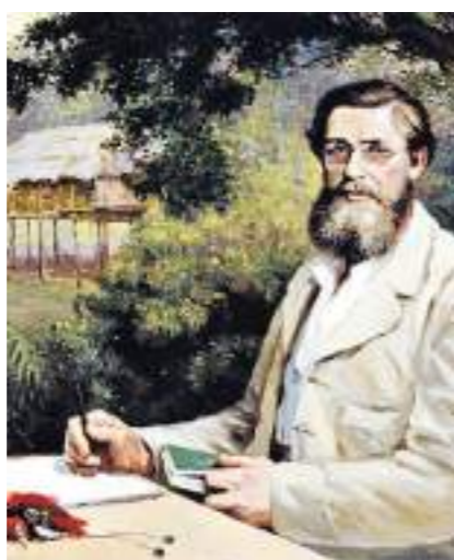
VOYAGE OF DISCOVERY Alfred Russel Wallace loved life in Bacan

discoveries were made shortly after, in a fit of fever, he solved the "species problem", deducing that "the fittest would survive". While Charles Darwin was procrastinating over his theory in Kent, Wallace was on the other side of the world, coming to similar