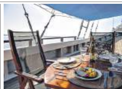
Indonesian archipelago, accessing places larger cruise ships can't reach. The Ombak Putih has an excellent galley, plus air-con, salon, library, snorkel gear, loungers and a crew equally adept at steering, cocktails, identifying fish and playing guitar.

A typical day begins when you fancy – on deck for sunrise, perhaps – with a 7.30am breakfast bell signalling the buffet is ready. A shore excursion by tender leaves around 9am to explore a remote