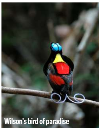
Wilson's bird of paradise